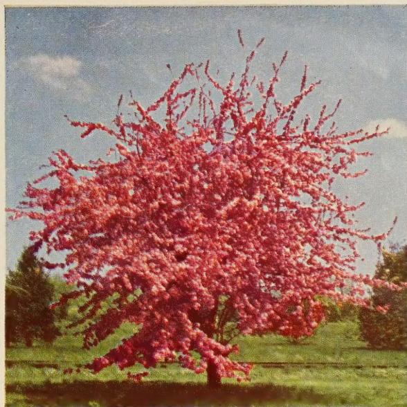
Hopa Flowering Crab

CUT-LEAVED WEEPING BIRCH. Slender tree with white bark, graceful, weeping branches; fern-like cut leaves. A most beautiful tree. 5 to 6 ft., $4.00 each; 6 to 8 ft., $5.00 each.